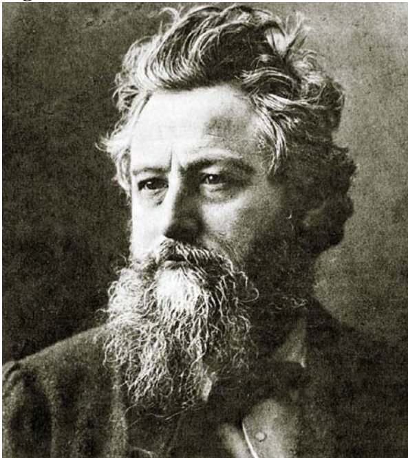
Figure 1: William Morris

Printed from a lecture delivered in 1884, the essay attacks the infamously exploitative system of labor in Victorian Britain, wherein the majority of people worked at mind-numbing tasks in squalid conditions for the benefit of the wealthy. Morris called for an end to the system, which he saw as tantamount to slavery, but he did so by asking for more than just better pay and shorter workdays. As a reputable artist, poet, and craftsman, Morris was in a unique position to demand that work be attractive and enjoyable. He believed that this aim would be fulfilled by making the products of work beautiful, looking back to medieval craftsmanship as a model.