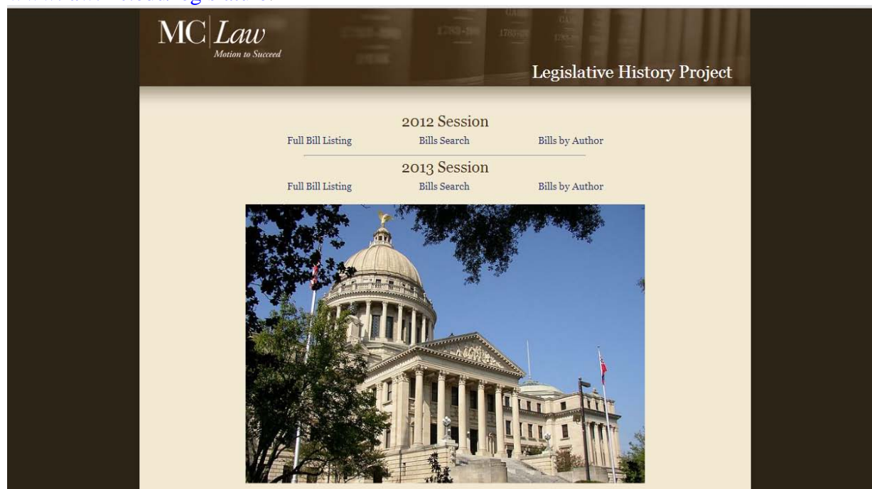
Figure 1: The home page of the Legislative History Project may be accessed at www.law.mc.edu/legislature .

To use the Project, an individual may simply access the website at law.mc.edu/legislature . The Library is proud of the hard work put into connecting video clips to individual bills as this option