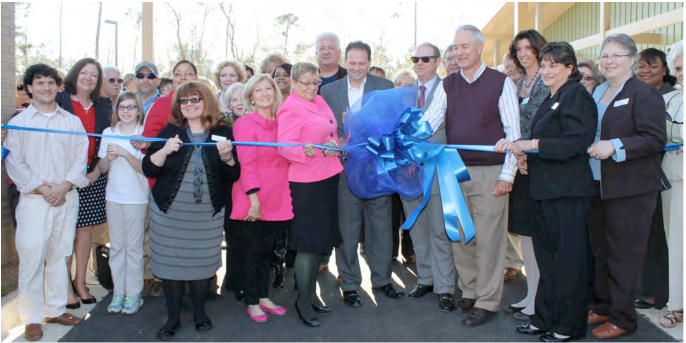
The ribbon cutting ceremony at the new East Hancock Public Library