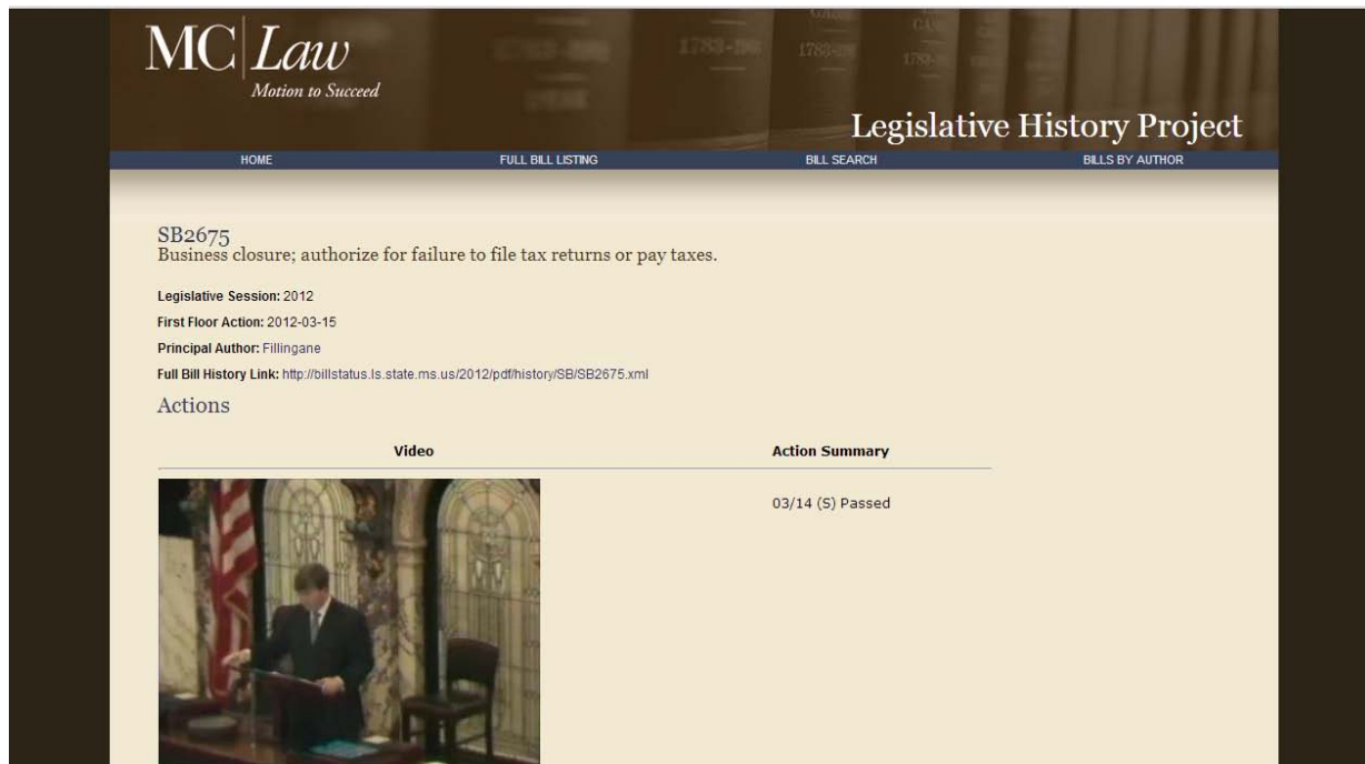
Figure 5: Once on an individual bill's page, the user may then access the Legislature's history page by clicking on "Full Bill History Link" and may watch all videos that have been associated with that individual bill.

The Library's Project is set up this way for many reasons. The Library recognizes that most people will not wish to sit and view a full day video of House or Senate debate. Recognizing this fact, the Library has made it easier for the individual wishing to view video of debate only on certain bills. Tying each individual video clip to a bill along with links to the bill's history, the Library has simplified the process for the user and has placed this important aspect of government information at the user's fingertips.